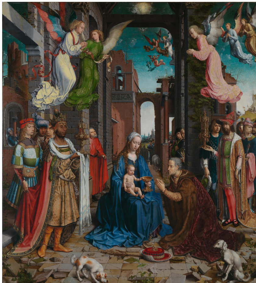
“The Adoration of Kings” by Jan Gossaert (1478-1532)